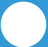
Wisley Sat Series 2020